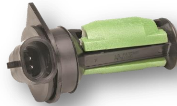
Windshield Washer Sensor