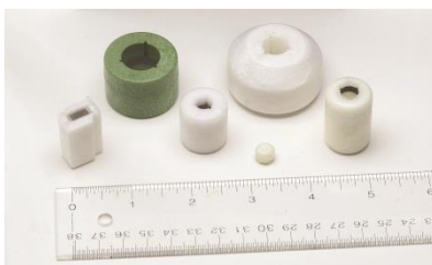
Injection molded mag- net/float assemblies