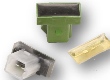
Non-intrusive liquid level sensor