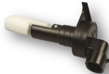
Automotive Wind- shield Washer Sensor