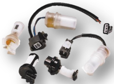
Automotive coolant and washer fluid sensors with harness connectors